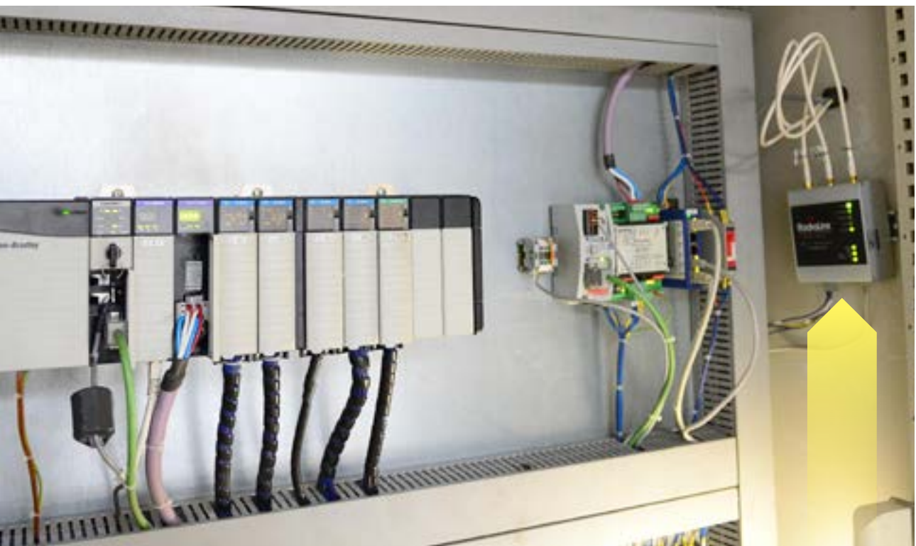
KIA Motors has a ProSoft Technology 802.11n radio on each of the five cranes, and also in the maintenance room.

KIA Motors is satisfied with the solution. “It helps us diagnose overhead cranes and monitor signals during the production from a safe position.”