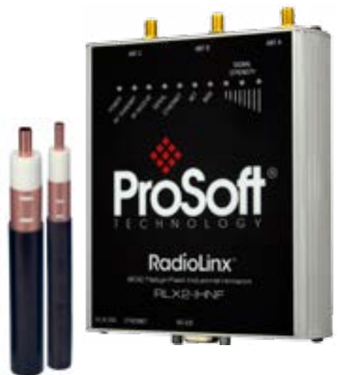
ProSoft Technology radio and radiating cables.