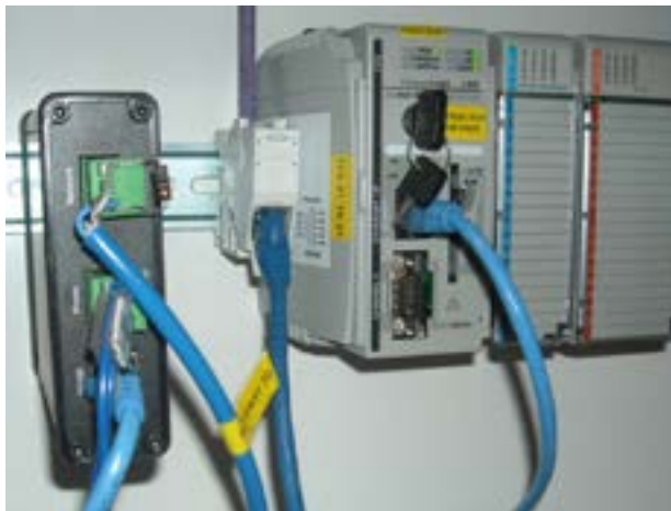
ProSoft Technology migration gateway.

For more information on Brains Brewery visit www.sabrain.com or www.brainscraftbrewery.com . And for more on IAC Engineering, visit www.iaceng.com .